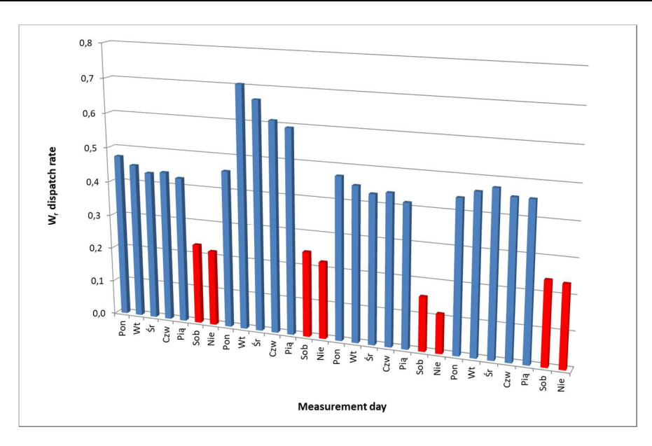
Fig. 5. Dispatch indicator for dust masks and replaceable filters

The analysis of the dispatch rate makes it possible to conclude that its value varies strongly and reaches values from 0.121 to 0.705. It can be clearly seen that this variability is strongly correlated with weekdays. Low values of the indicators appear on Saturdays and Sundays. In these periods, there are fewer employees at work and only works on excavation control and the maintenance of necessary devices are carried out. The highest air dustiness values occur at workstations during excavation drilling and coal extraction. Therefore, it can be assumed that the awareness of employees shaped in this way motivates them not to use personal protective equipment. The results of the study indicate that only about 20% use protective masks on weekend days.