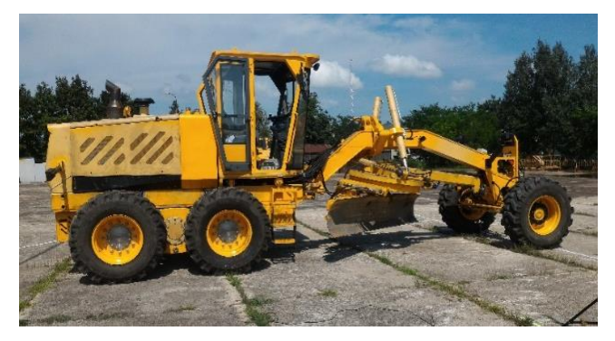
Fig. 4. MISTA RD-165 FHAD - first tested prototype

MISTA RD-165 FHAD grader acoustic power tests were carried out at 2 stages of research and development works. The first measurements were carried out at the first version of the prototype. The machine tested at this stage had a developed superstructure and drive train, while body finishing elements such as engine covers, radiator covers, or exhaust system mounting and insulation elements were not yet worked out.