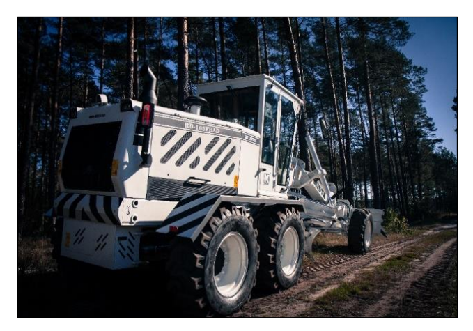
Fig. 3. Rear view of the Mista RD-165 FHAD grader