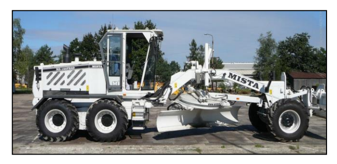
Fig. 5. MISTA typ RD-165 FHAD - second prototype

The grader underwent further work, The new engine covers were design. Soundproofing liners were applied to their inner side. A louver was installed to direct the propagation of noise from the radiator fan toward the ground. The installation of the exhaust system was improved, isolating it from the body. This reduced the number of potential secondary noise sources. The second series of test included a production version of the machine. It score the changes due the tests from the first prototype.