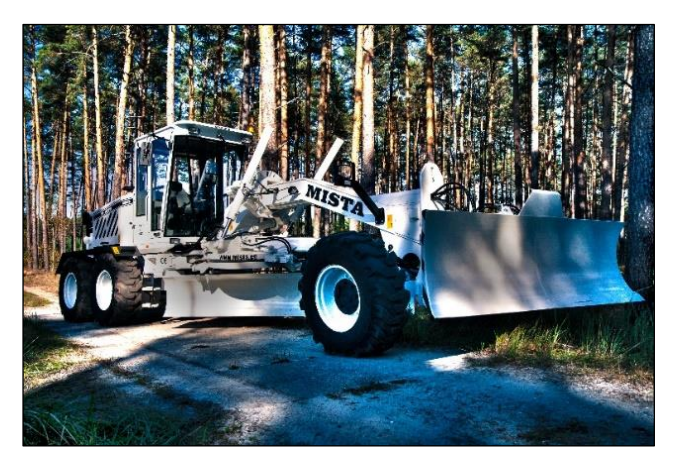
Fig. 1. Front view of the Mista RD-165 FHAD grader

Grader RD-165 FHAD manufactured by MISTA Sp. z o.o. Stalowa Wola is the example of a machine that falls under the above mentioned requirements and was subjected to vibroacoustic testing at the prototype and manufacturing stage. Machine intended for testing was indicated by the manufacturer, i.e. the MISTA company. The grader has got a 129kW engine with a maximum speed of 2200 rpm. It worked 10 hours until the measurements began (Fig. 1).